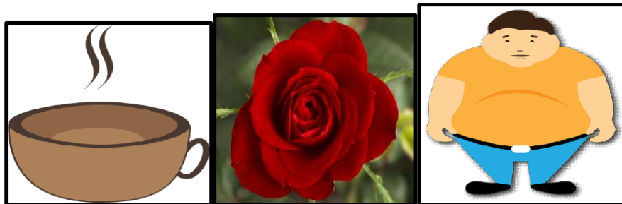
COLD , HOT